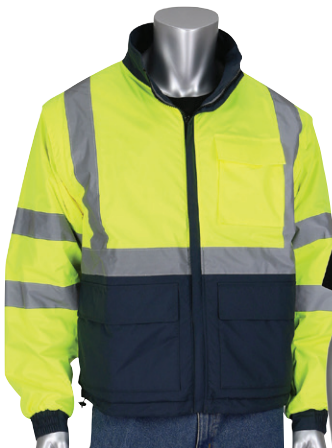
333-1500 - WITH SLEEVES