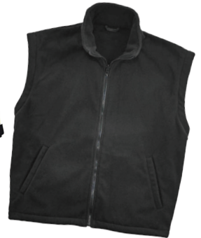
8381 - VEST