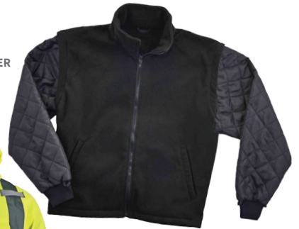
8381 - LINER