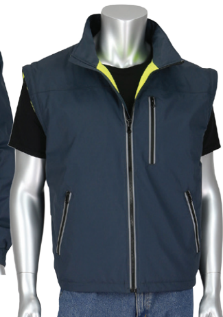
333-1500 - REVERSED WITHOUT SLEEVES