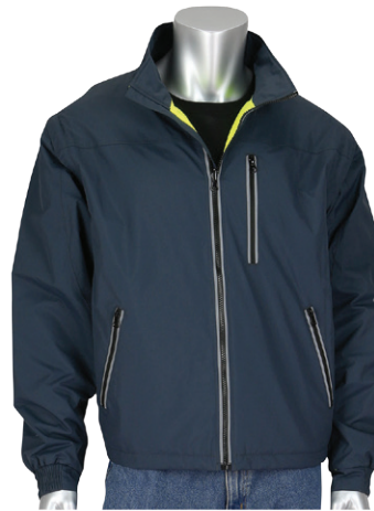
333-1500 - REVERSED WITH SLEEVES