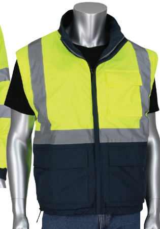
333-1500 - WITHOUT SLEEVES