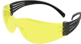
SF103AF-BLK 7100238183 Lens: Amber, AF/AS Frame Color: Black