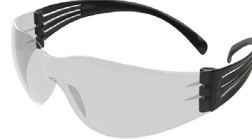
SF107AF-BLK 7100238257 Lens: Indoor/Outdoor, AF/AS Frame Color: Black