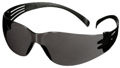
SF102AF-BLK 7100238172 Lens: Grey, AF/AS Frame Color: Black