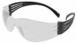
SF102AF-BLK 7100238172 Lens: Clear, AF/AS Frame Color: Black