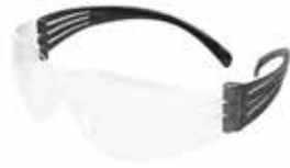
SF101AS-BLK 7100238173 Lens: Clear, AS Frame Color: Black