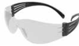
SF107AF-BLK 7100238257 Lens: Clear, AF/AS Frame Color: Black