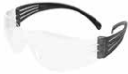
SF101AF-BLK 7100238174 Lens: Clear, AF/AS Frame Color: Black