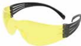
SF103AF-BLK 7100238183 Lens: Amber, AF/AS Frame Color: Black