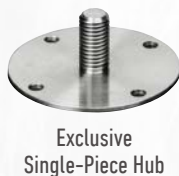
Exclusive Single-Piece Hub