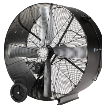
PBX-B Belt Drive