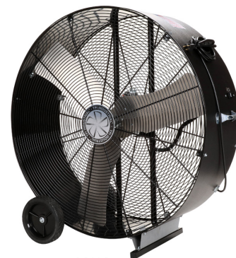
PBX-D Direct Drive

Meets OSHA standards / 1-year limited warranty