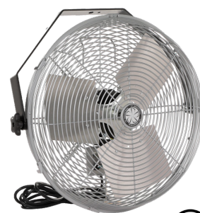
Yoke Mount / Workstation Model

Meets OSHA standards / 1-year limited warranty