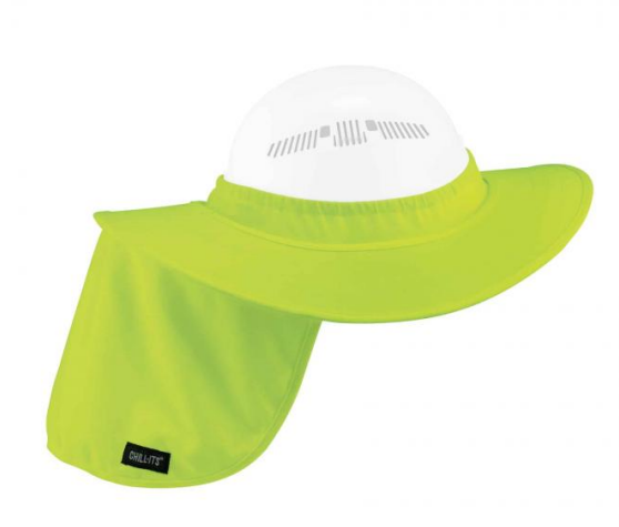
SUN PROTECTION SHADES FACE AND NECK FOR PROTECTION AGAINST SUN DAMAGE