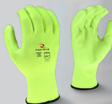
RWG22 Coated Work Glove