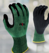
RWG538 Cut Protection Work Glove