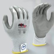
RWGD101 Cut Protection Work Glove

RADIANS OFFERS MANY WORK GLOVES IN SIZES RANGING FROM XS-2XL