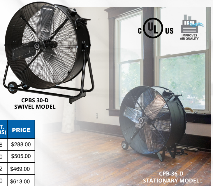
CPBS 30-D SWIVEL MODEL

MOTOR: 2-speed, 120V, open ventilated, ball-bearing and permanently lubricated, 3.6 Amp max BLADE: Aluminum, 3-paddle; steel for 36" unit SWITCH: Rocker or Rotary CORD: 6' long, SJT type 3 conductor; 10' on 36" model GUARD: Spiral wire (front & rear) OSHA approved WHEELS: Rubber, diameter varies HOUSING: 20-gauge steel powder coated, black finish