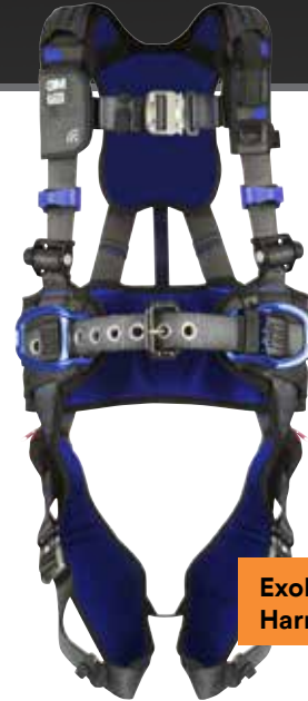
ExoFit™ X300 Harness