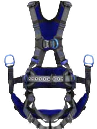
X-Style Tower Climbing (Telecommunications)

Equipped with contoured form-fitting chest configuration to don easily in 'X' shape. X-Style harness buckle contours to your body, providing an optimal central connection. New horizontal leg straps complement the range of motion workers require on the jobsite.