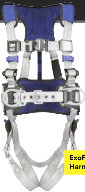
ExoFit™ X100 Harness