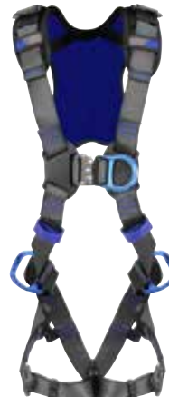
X-Style Climbing/ Positoning (Wind Energy)