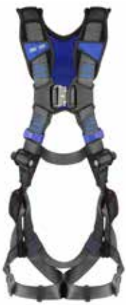
X-Style General Industry

Backed by science to fit your body. Our new quick-connect chest buckle, simplified harness sizing ranges, and leg straps have been designed with you in mind. No matter the season, wardrobe or body shape, the 3M™ DBI-SALA® ExoFit™ X300 Comfort X Style Safety Harness will help ensure you select a harness that fits your body securely.