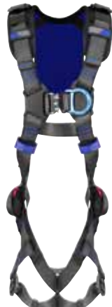
X-Style General Industry Climbing