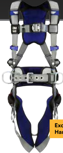
ExoFit™ X200 Harness