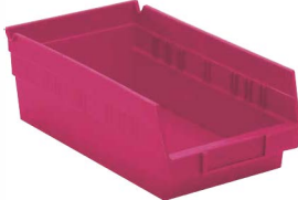
Pink color in select sizes