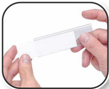
LTR-0813 Clear Label Holder and Insert Clear label holders and laser label inserts. Package of 25. Label holders fit all bins (except QSB100).