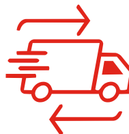
Vendor Managed Inventory