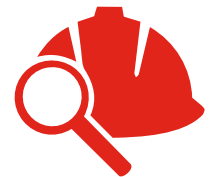
Safety Solutions & Supplies